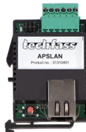
Fig. 1:APSLAN converter

The communication converter APSLAN is designed for communication with APS mini Plus system via TCP/IP interface or for providing one-way communication from the readers' WIEGAND output via TCP/IP interface. The mechanical design is DIN rail mountable.